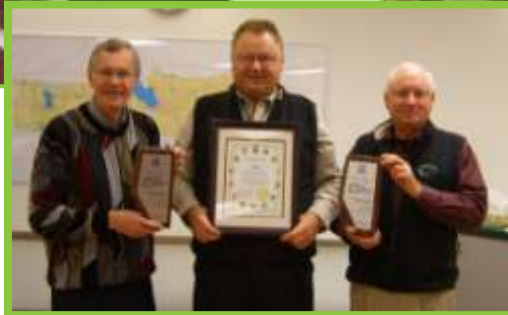
Town of Millet