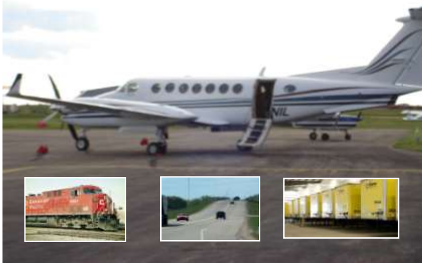
City of Wetaskiwin