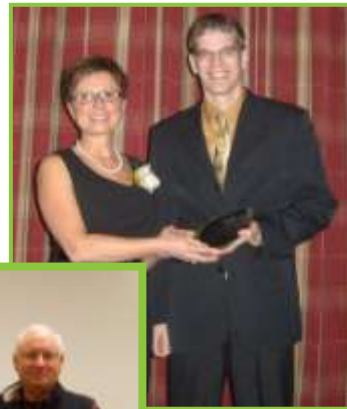
County of Wetaskiwin