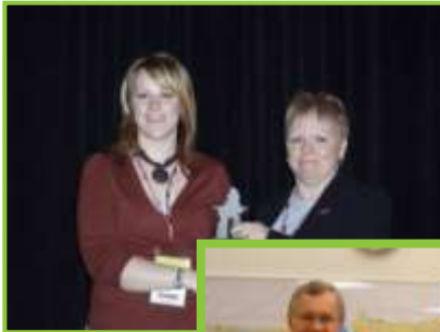
City of Wetaskiwin