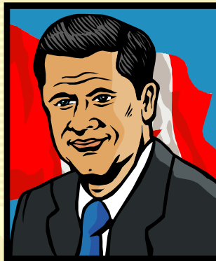
Stephen Harper Canada's 22nd Prime Minister