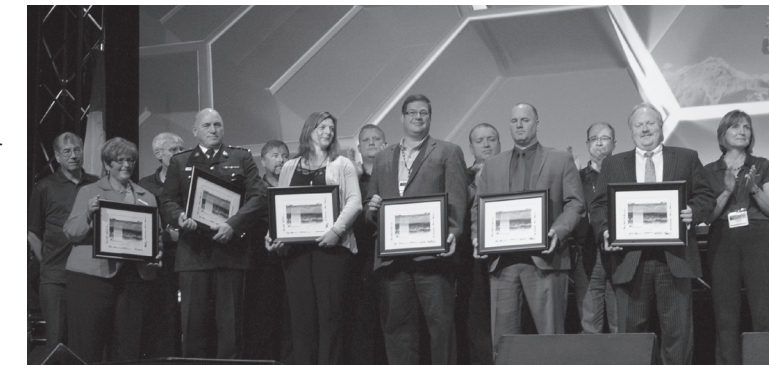
A presentation of certificates recognizes the support received from so many quarters

evacuation in Alberta’s history ... and the 2nd largest insured disaster in Canada. There were 372 homes and six apartment complexes lost ... displacing over 730 households.