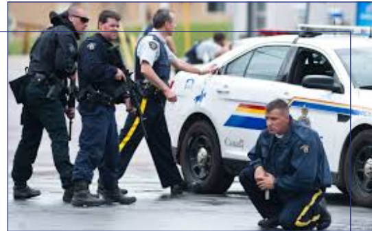
Alberta Police Act review