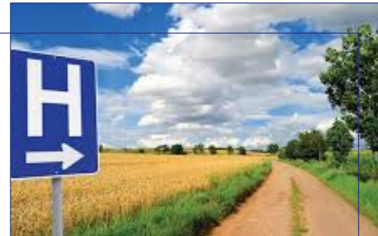
Equitable access to healthcare