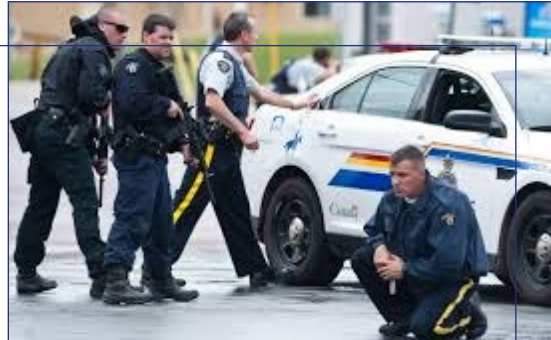
Policing and justice